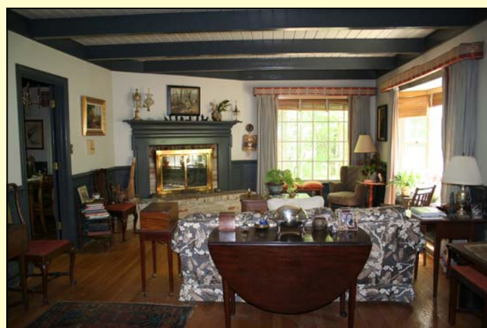
Living room with view into dining room.