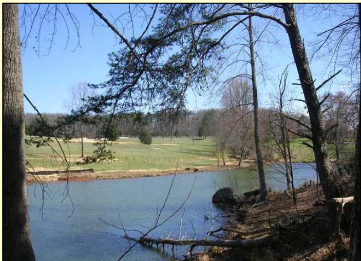
Pond from the back of home.