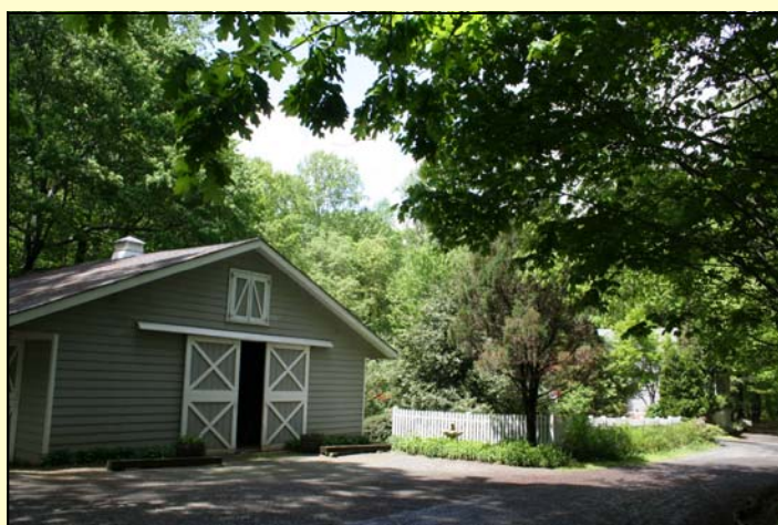
View of the courtyard.