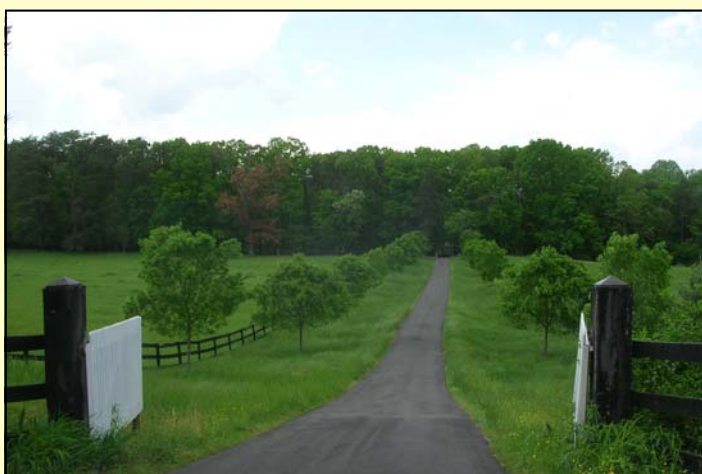
Tree lined drive from Free Union Road.