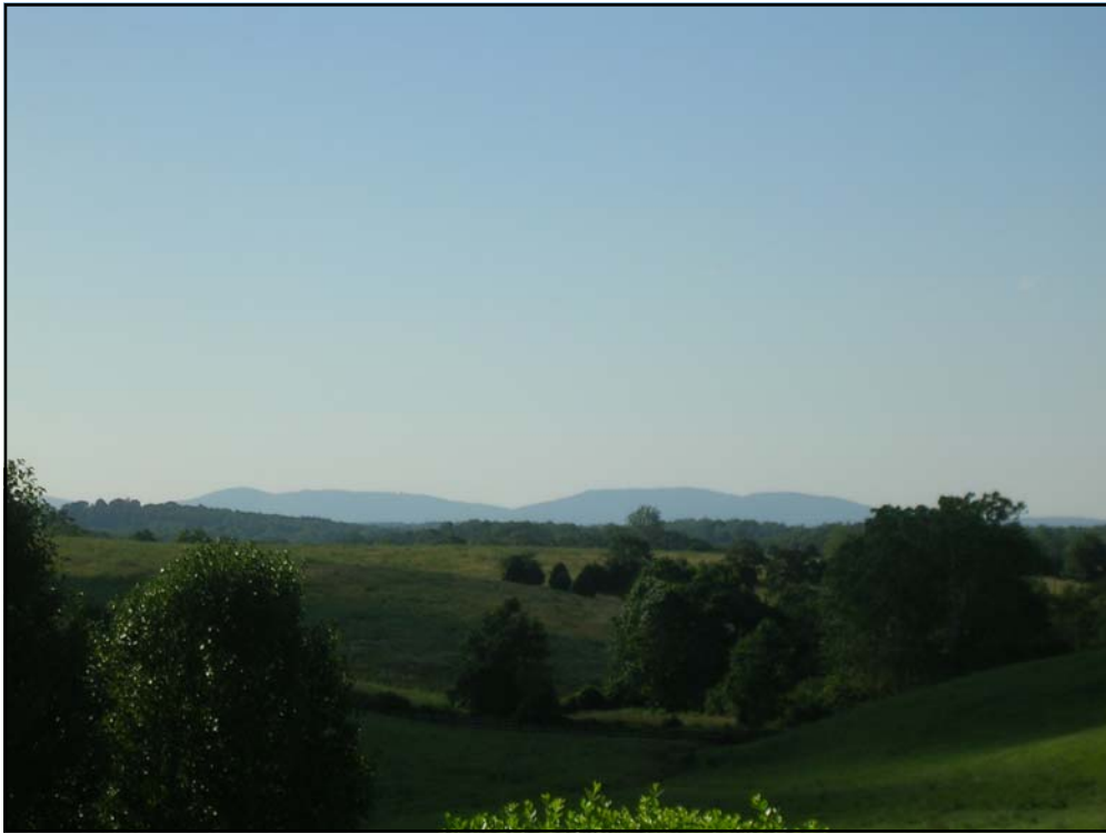
View from the house.