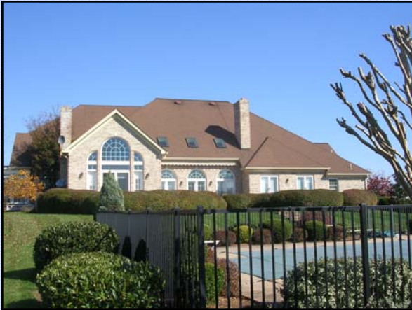
Back of house has large patios leading down to pool.