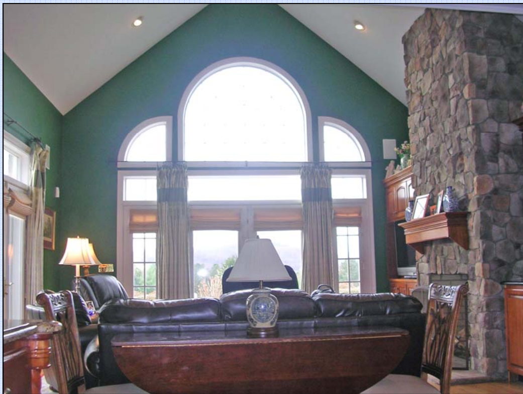
The comfortable family room adjoins the kitchen and has stone a fireplace and mountain views.

The warm and inviting gourmet kitchen boasts cherry cabinets, granite countertops, and stainless appliances. It is conveniently set adjacent to a large family room with cathedral ceilings and a stone fireplace as well as an attached dining area and cozy sunroom.