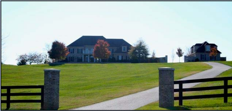
Entrance drive and house complex.