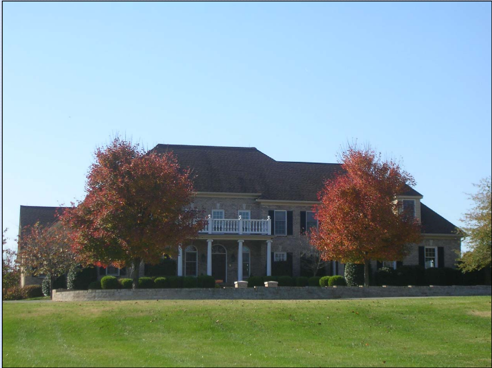
3105 Ragged Ridge Lane Blue Springs Farm