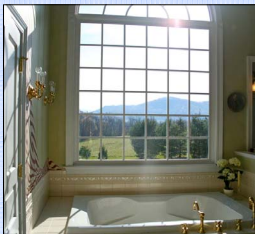
Master bathroom view.