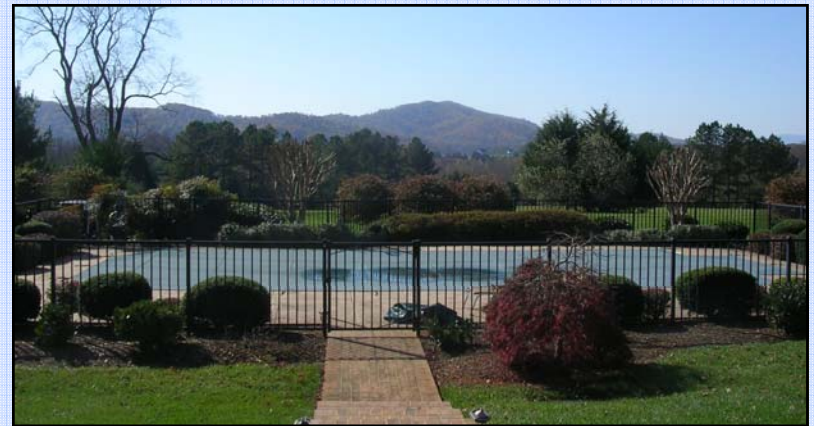
Large pool with view.