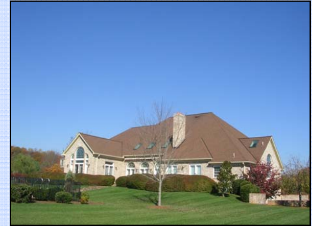
Back of house with lovely rolling yard.